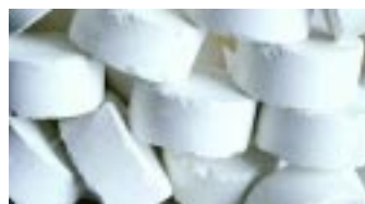
Standard tablets (left) are large and have sharp edges, leaving large gaps that can result in solution inconsistency. Constant Chlor® Plus briquettes, however, are relatively small and "pillow" shaped, for maintaining optimum packing in the spray bed.

Supply water injected into the chlorinator sprays upward into a bed of briquettes. Due to the unique design of the briquettes, this short intermittent spray cycle contacts the entire bottom of the bed evenly, not just the material resting on the grid.