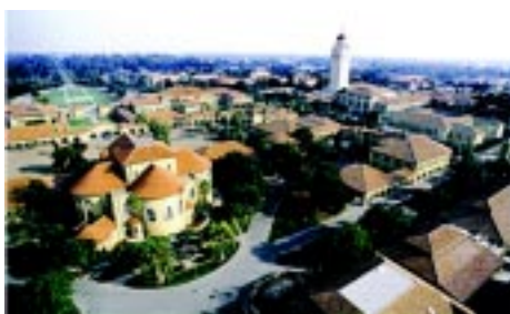
Stanford buys water from San Francisco and boosts the chlorine to maintain a required residual in the university's 100 miles of domestic water piping.

For three years, Stanford University has been rechlorinating its water with no difficulties. The University buys water from San Francisco and boosts the chlorine to maintain a required residual in the university's 100 miles of domestic water piping.